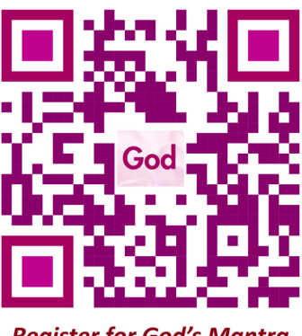
Register for God's Mantra

Or visit the URL: https://alakhgod.com/gods-mantra/